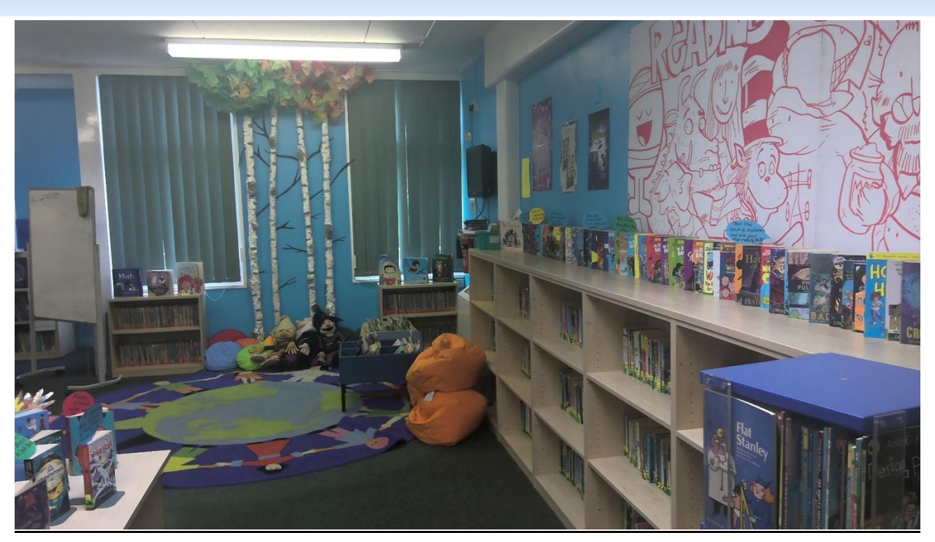
<u>Our school Library – we were successful in being awarded a Foyles Foundation grant of £5000</u> towards more fantastic books for our wonderful Library.